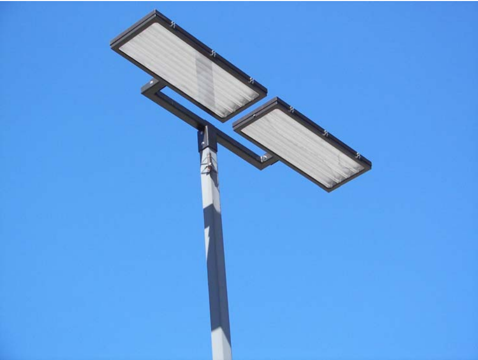
Horizontal, 4' Fixtures