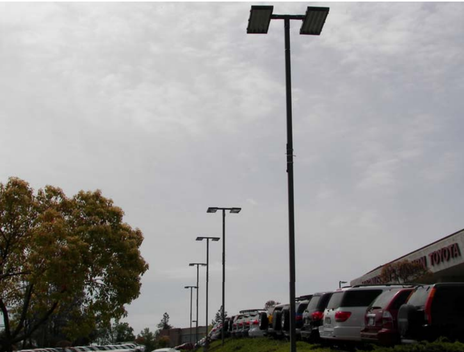
Horizontal, 4' Fixtures